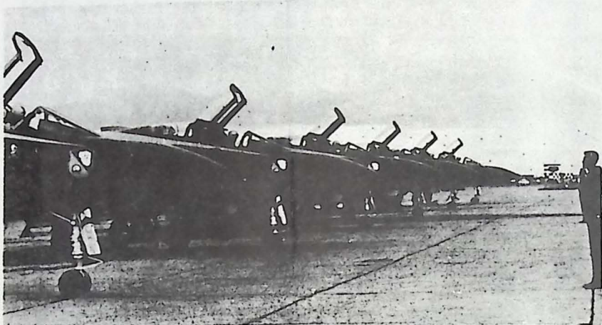
F4 Phantom fighter jets in formation prior to departure from flight line at Clark Base in Pampanga.