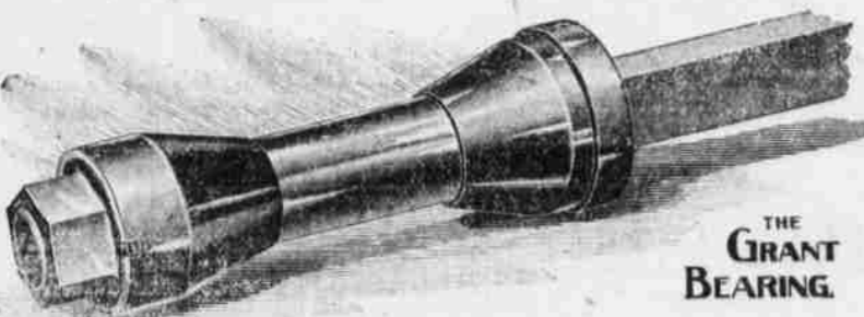
THE GRANT BEARING.

Is successfully used on all kinds of Vehicles.