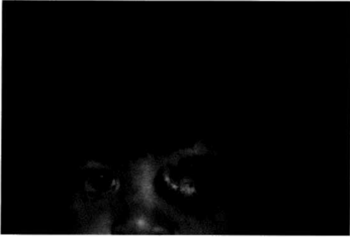
Fig 1.—Three year old female child with untreated congenital nasolacrimal duct obstruction forming lacrimal sac abscess.