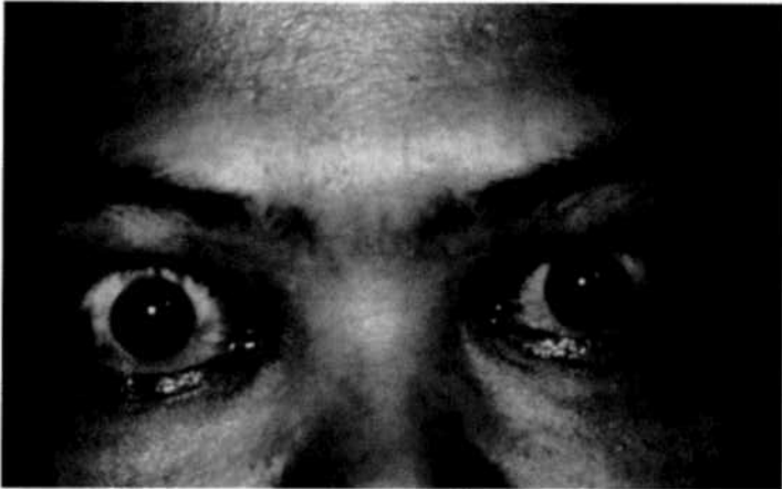
Fig 3.—Thirty six year old Hawaiian female with malignant exophthalmos and optic neuropathy causing severe visual loss in both eyes.