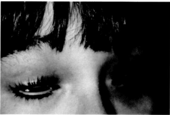
Fig 5.—Nine year old male status post enucleation of both eyes due to retinoblastoma with severe orbital atrophy and socket contracture.