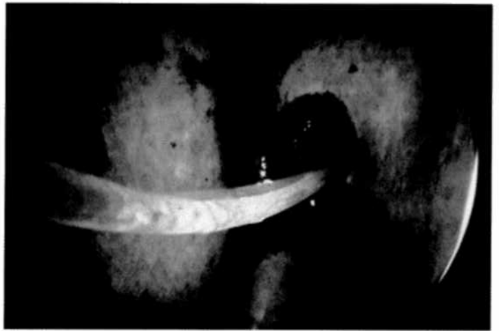
Fig 2.—Intraoperative intranasal photograph of osteotomy with silicone stents in place immediately after endoscopic laser assisted dacryocystorhinostomy.