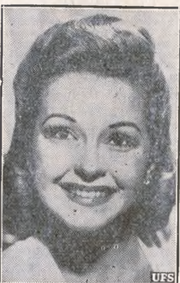
SOME DOLL! —Members of United Doll Novelty and Toy Workers union chose lovely film actress Nancy Kelly as "most beautiful doll." Her beauty would make superlative product, they said.