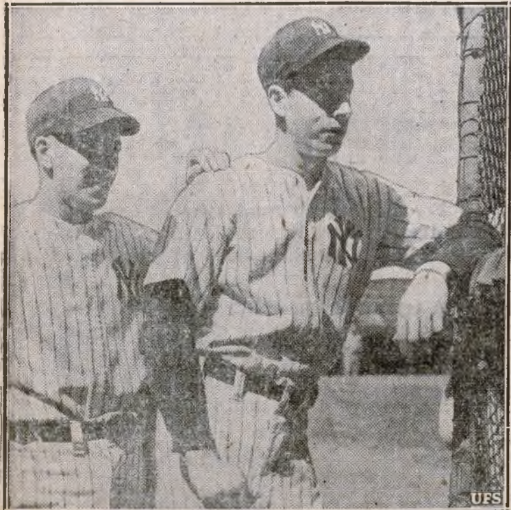
YANKEE SLUGGERS —Expected to take heavy role in forthcoming world baseball series are New York Yankees leading batters. That's Phil Rizzuto, 1941 rookie infielder, at left, with widely known Joe DiMaggio, outfielder.