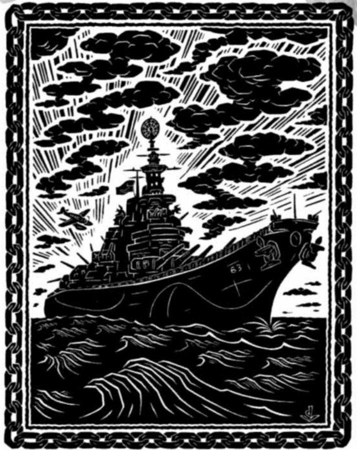
“Mighty Mo” - the dramatic, striking block print of the Battleship USS Missouri, now berthed at Pearl Harbor and visited by more than 300,000 visitors each year.