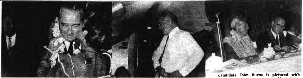
VICE PRESIDENT Lyndon Johnson receives warm welcome from unidentified Maui woman on his recent "barnstorming" trip for Democrats.