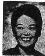
PATSY TAKEMOTO MINK Housewife Attorney Former Legislator