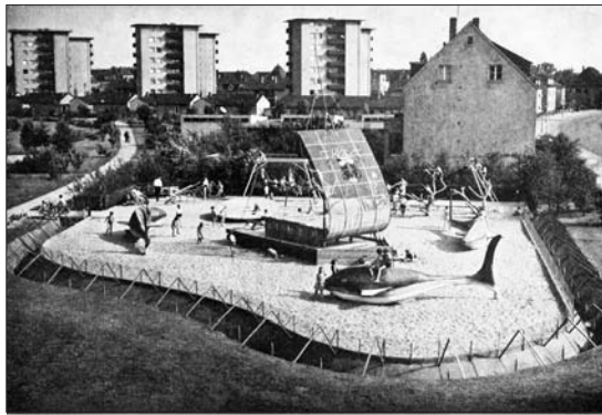
KON-TIKI-FLOSS I N M A N N H E I M