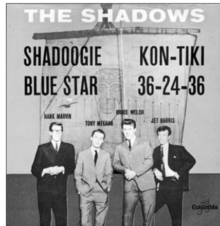
The cover of Shadows' famous Kon-Tiki EP.

How will the inscription of his archives on UNESCO's Memory of the World Register influence Heyerdahl's reputation? Thor Heyerdahl was both an adventurer and a researcher, but maybe at different times and on different topics. He had a fantastic ability and enthusiasm to make any topic seem relevant and interesting. He could get all sorts of people interested in very specific research questions, often unconnected with their own lives and experiences. Literarily thousands of comments in newspapers all over the world testify to this fact. Yet, sometimes his treatment of the finer details of his research subject could be inadequate. Where he easily saw the big picture, he did not always see or understand all the pixels constituting it. I believe that the status given to his achievements and his archives will affect the polarised and often destructive debating on Heyerdahl's theories and personality, which he himself contributed to. Instead, both researchers and journalists will focus on what the