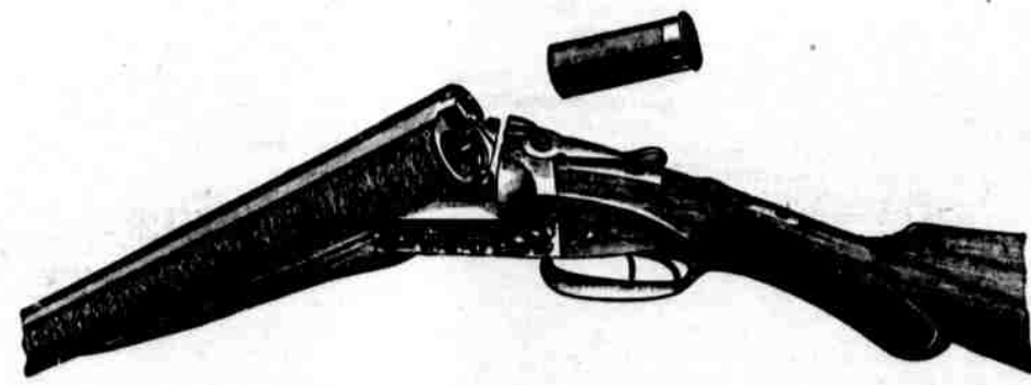
An L. C. SMITH HAMMERLESS SHOTGUN with patent ejector and all other modern improvements. Value $50. This fine gun is from the store of Woods & Sheldon.