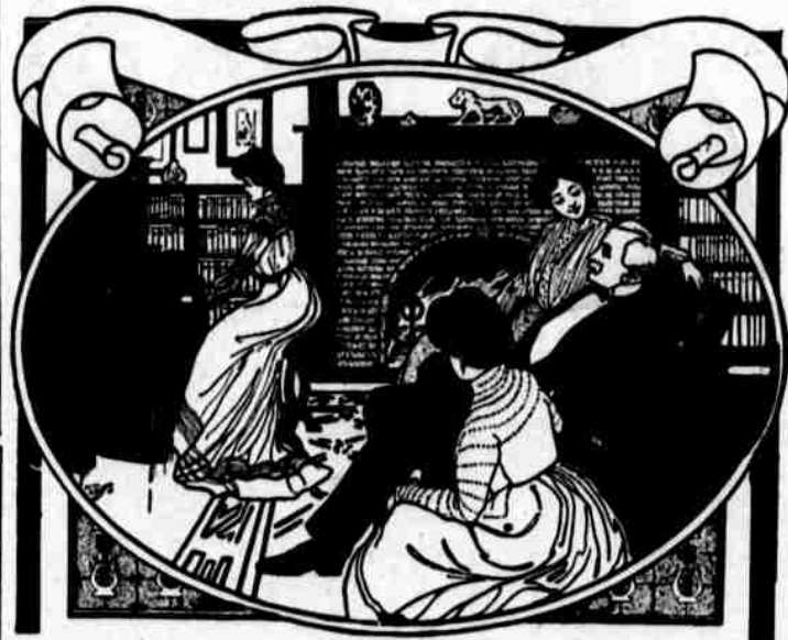
ANGELUS PIANO PLAYER, value $250. Guaranteed by the agents for Hawaii, the Hawaiian News Co., Ltd. The new Angelus is musical perfection; besides it is a thing of beauty in finish and appearance.