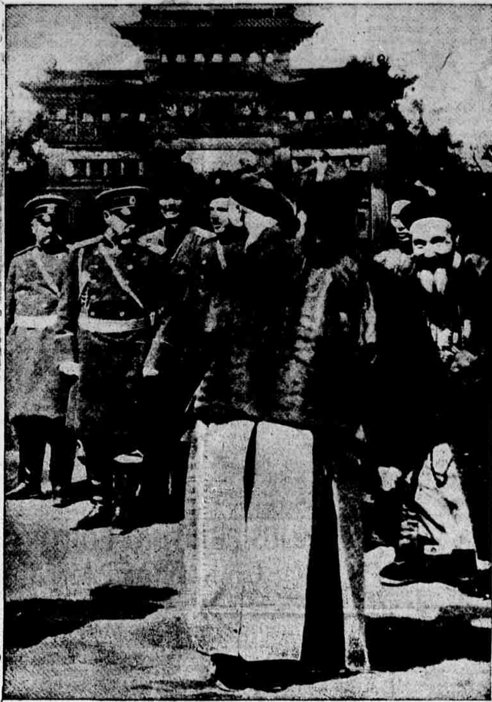
KUROPATKIN IN THE IMPERIAL CEMETERY OF MUKDEN WITH THE CHINESE AUTHORITIES.