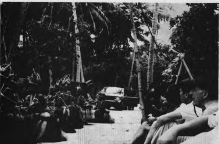
Members of the Mission watch the Yapese Traditional women dance in the District of Yap.