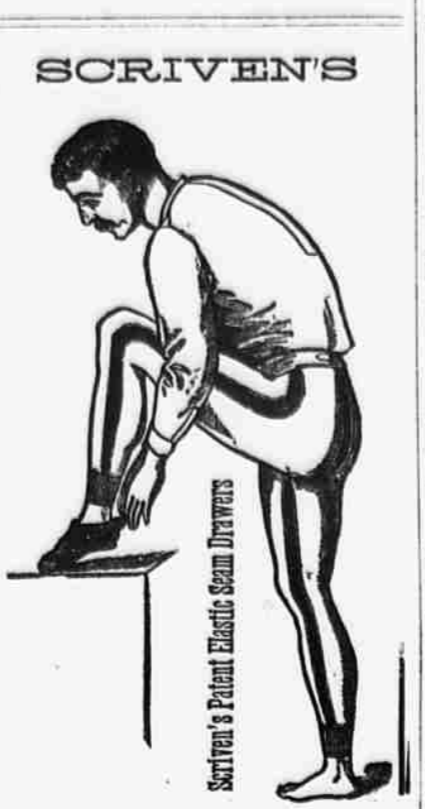
Patent Elastic Seam Drawers!

We want to call the attention of our patrons to a novelty which, from the favor it has been received with, we believe has come to stay and become an indispensable article of gent's furnishing.