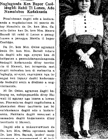
Dimmagsadit, Honolulu daytoy uppat nga agkakapinas a pensionada Filipina agawiddan...