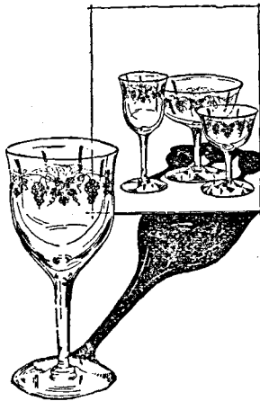
The Vintage Pattern

Dear to the heart of every woman are her jewels. She takes pride also in the possession of at least a few jewels of the well-dressed table—it's Glassware. Because of the acceptability of glassware as gifts, she will be interested to know that Dimond & Company displays the most comprehensive collection of the finer glassware in Honolulu. It comprises excellent pieces of pressed, blown and cut glass from such famous makers as: Paden City Glass, Luzerne Cut Glass, Heisey Glass, Fenton Art Glass, Murano Italian Glass.