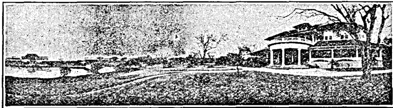
SPEND YOUR WEEK-END AT HALEIWA HOTEL

GOLF SWIMMING FISHING BOATING RIDING — Unexcelled Cuisine