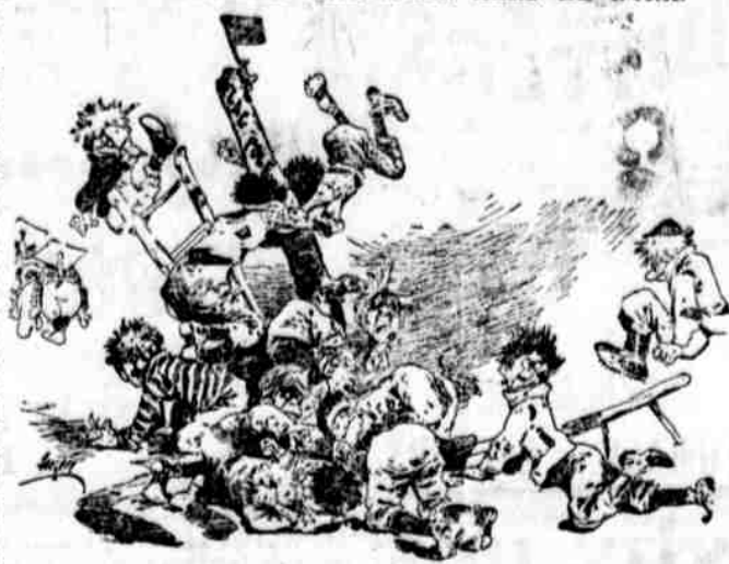
—Cleveland Plain Dealer.

THE COLLEGE BOYS ARE AGAIN HARD AT WORK.