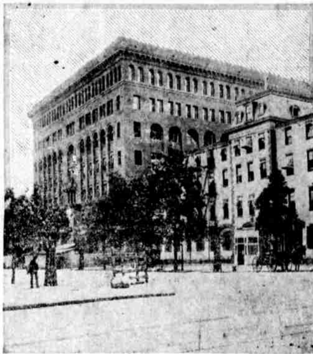
THE NEW AND THE OLD GOVERNMENT PRINTING OFFICES

The new government printing office, now nearing completion, although it has seven acres of floor space, will be only large enough for the current work of the government and does not make any substantial allowance for future growth. Yet the structure is so large that it has consumed in its erection 14,000,000 pounds of steel, one-seventh as much cast iron and 45,000 barrels of portland cement. The doors have been made of an asbestos composition, the door and window frames of iron and the whole structure is as nearly fire-proof as it was possible to make it. The cost, when it is completed, will be about $2,400,000.