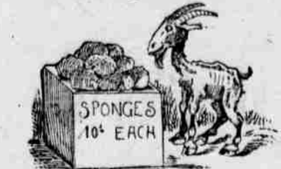
"Gee whizz! there's an elegant meal!"