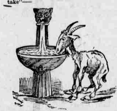
"A drink of water."