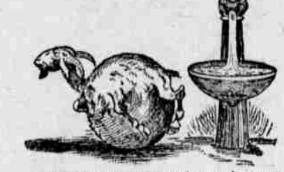
"Say, what have I ever done to be treated this way?"—Truth.