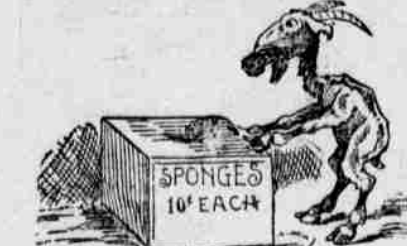
"Well, now, that's nice! But I guess I'll take!"