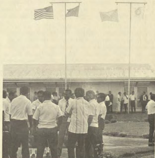
LEGISLATORS AND GUEST gather outside on the opening day of the Fourth Congress of Micronesia. The flags are those of the United States, Trust Territory, United Nations and the High Commissioner.

One significant delay in the business of the Congress caused by the credentials challenge was the State of the