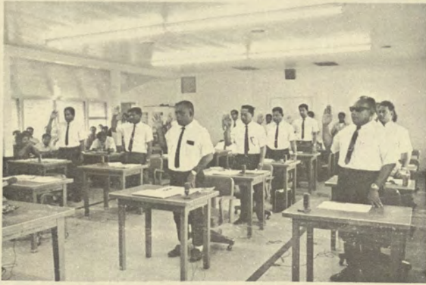
MEMBERS OF THE HOUSE of Representatives take the oath of office in the House chambers on Capitol Hill.