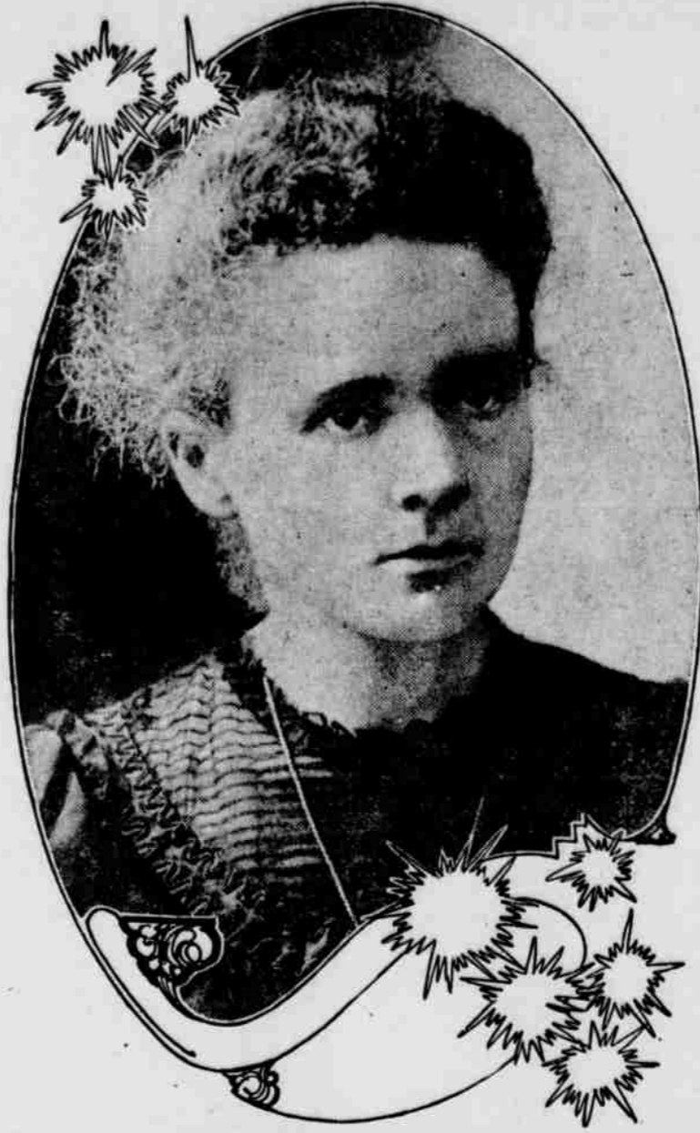
MME. CURIE, "THE CLEVEREST WOMAN IN THE WORLD."

M ME. CURIE, the famous French scientist, who, with her husband, discovered radium, promises an early visit to the United States. She has been called both the greatest and the cleverest woman in the world. It is said, in fact, that it was due more to her researches and experiments than to those of her late husband that the wonderful new element was discovered. Her husband refused the Cross of the Legion of Honor because it had not been offered to Mme. Curie. No woman in all the history of the race has been received with such acclaim by the scientific world as has Mme. Curie. Her place in the high temple of fame is secure. Mme. Curie is the daughter of a scientist and grew up in her father's laboratory. It is said that she discarded dolls at the age of five for crucibles, retorts and other chemical apparatus.