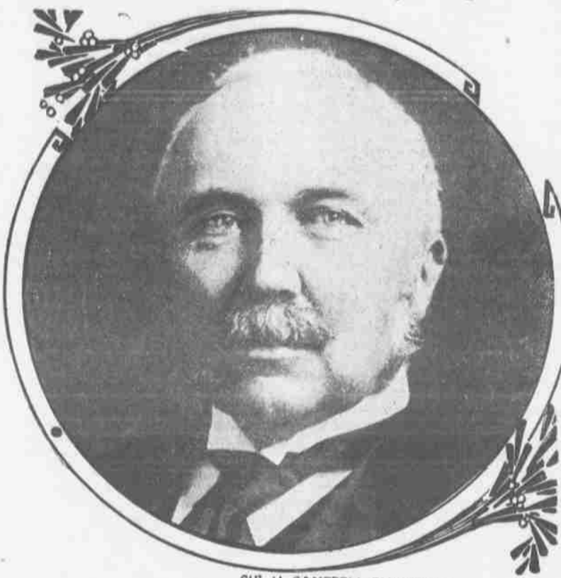
SIR H. CAMPBELL-BANNERMAN

LONDON, December 5.—The cabinet has resigned. Campbell-Bannerman has been summoned to form a new one. It is forecasted that the new Liberal cabinet will include Morley, Asquith, Elgin and Gray.