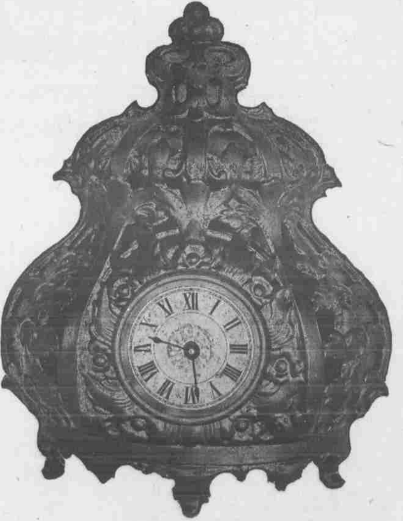
THIS ILLUSTRATION WILL GIVE THE READER A GOOD IDEA OF THE APPEARANCE OF THE NEW ORNAMENTAL PARLOR ALARM CLOCK, BUT THE ACTUAL SIZE OF THE CLOCK IS MUCH LARGER; IT STANDS ABOUT 12 INCHES HIGH AND IS MASSIVE IN APPEARANCE. IT IS MADE OF EBONIZED BAR BUFF GUN METAL, OF VERY ORNAMENTAL DESIGN, AND IS FITTED WITH AN EXTRA LOUD BELL ENTIRELY HIDDEN FROM VIEW.