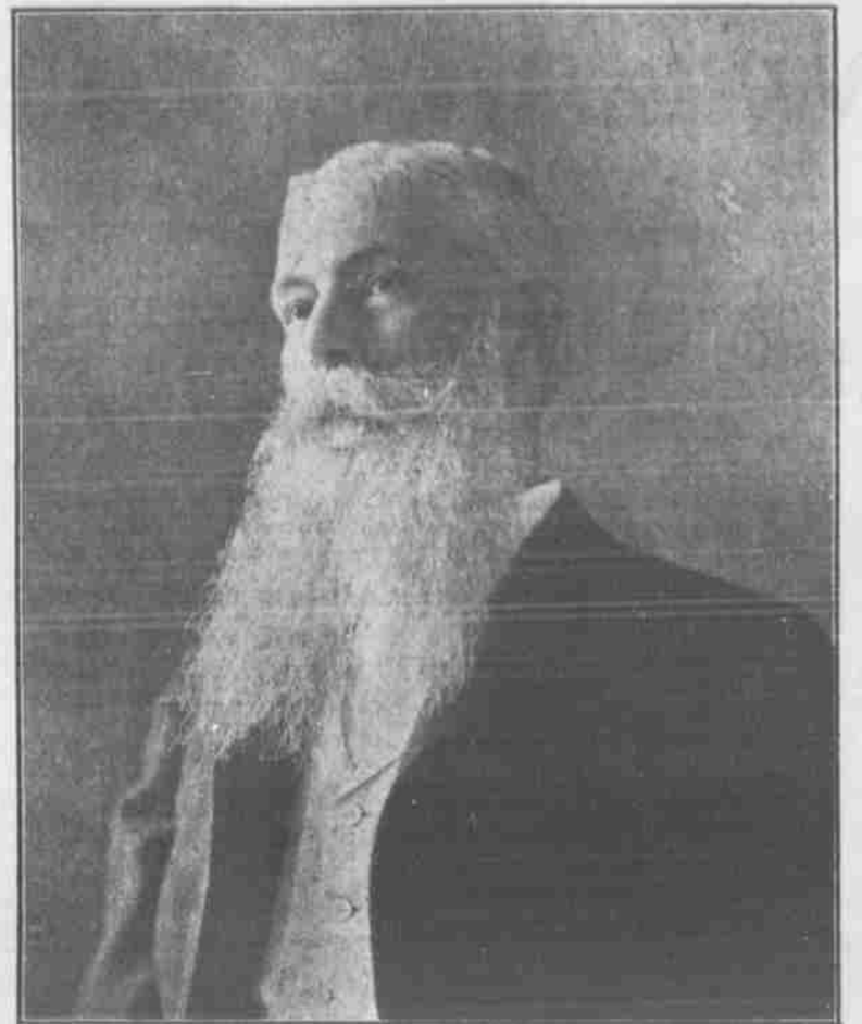
SANFORD B. DOLE.

Nine years ago today, Sanford B. Dole, as President of the Republic of Hawaii, formally turned over the islands to the United, at flag-raising ceremonies held at noon at the Capitol, in the presence of an immense gathering.