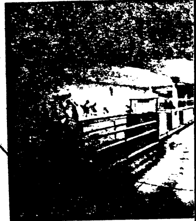
SCENE during the Hill