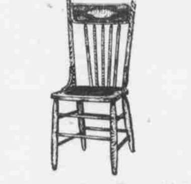
Leather or Cane Seat, $1.00 Solid Oak.....