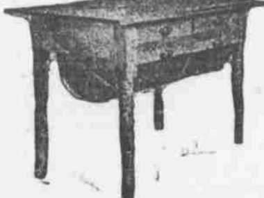
A Seattle Kitchen Queen. The Best Table Made..... $4.50