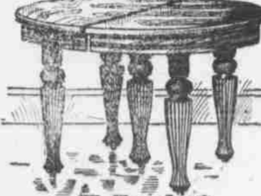
Solid Oak Golden or Weathered.... $13.50 up