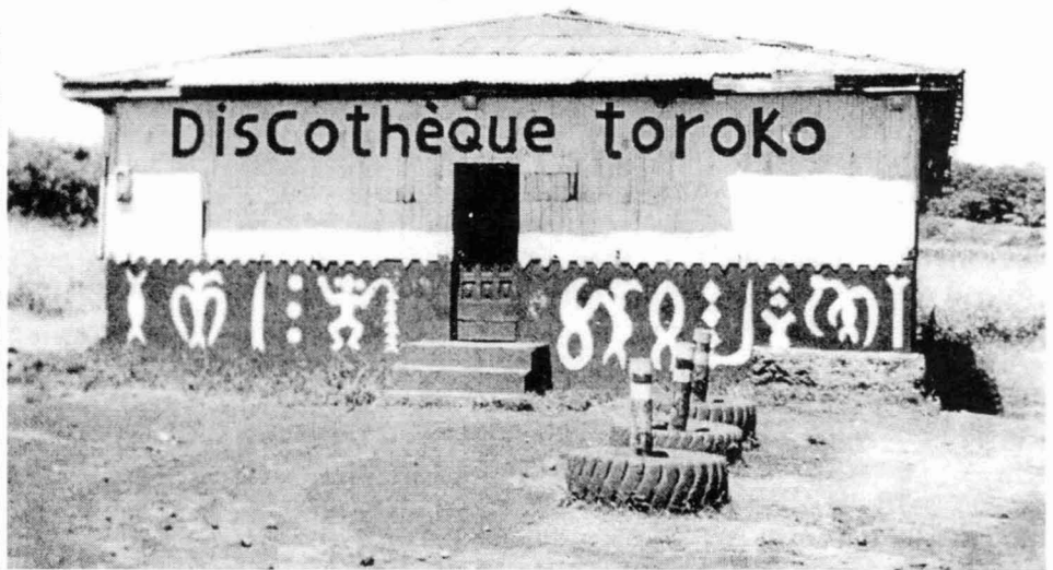
Disco Toroko: a hybrid feature of Rapa Nui culture today

Te Moai, a he koe ka ki mai i te parauti'a?! E hia 'a'amu e ai ro 'a i a koe, mo 'a'amu mai ki a matou?! E te Moai, ki he koe e u'i'ena? [Moai, when will you tell me the truth?! How many stories do you have to tell us?! Moai, where are you looking at?]