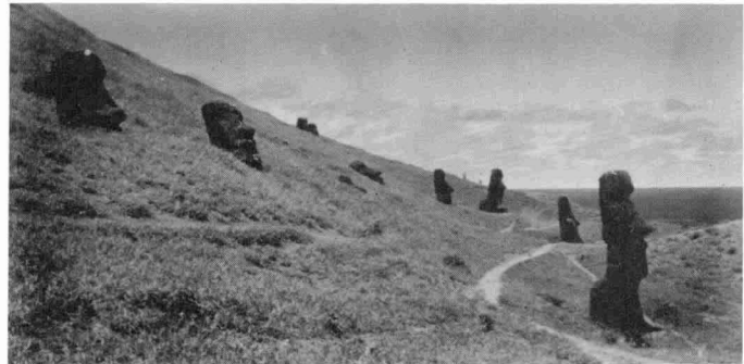
Are the statues emerging from the earth or is the earth swallowing the statues?

As it happened with other Pacific islands, the arrival of the West had disastrous consequences: progressive devastation of fauna and flora, and enslavement of the indigenous. The Peruvian slave raid of 1862 alone led to a nearly complete annihilation of the Rapanui people.