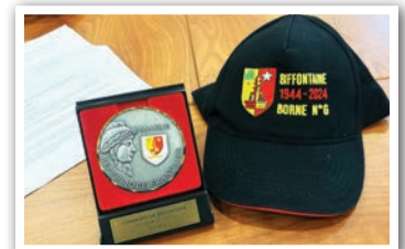
Letter and gifts from Biffontaine.