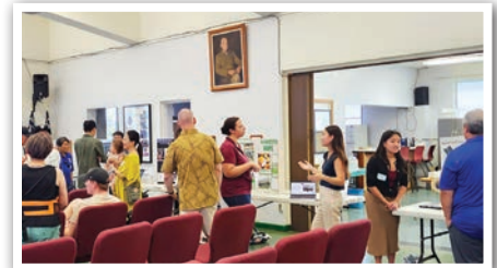
Members and attendees interact with L2A students, learning about their projects.