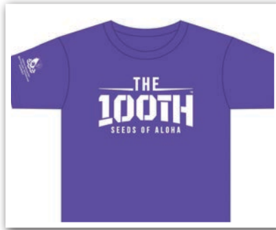
“The 100TH, Seeds of Aloha” logo t-shirt.