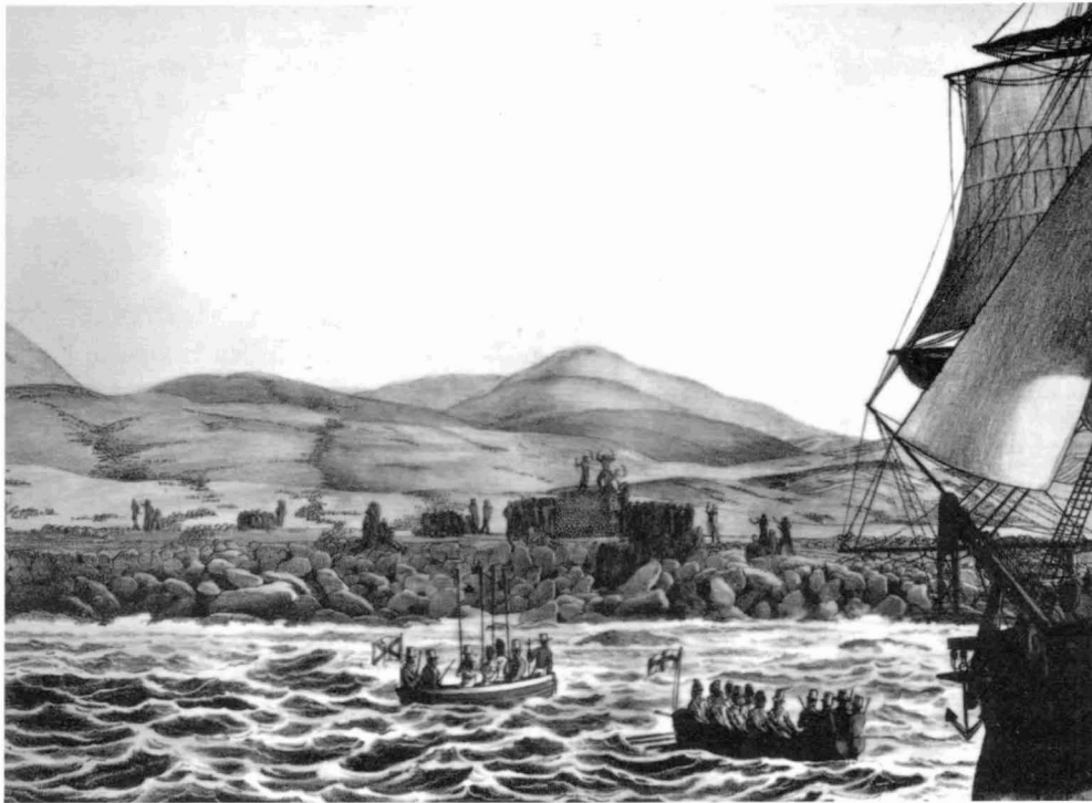
Alien European genes had little chance of being introduced to Easter Island in the early 19th century when visiting sailors could get no nearer to shore than this. The drawing depicts the Russian ship Rurick at the island in 1816.

Bahn and Flenley (1995:20) scoffed at my theory that Easter Island's original inhabitants were American Indians who died out as an ethnic entity because they had no