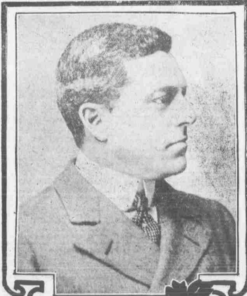
GEO. B. McCLELLAN.