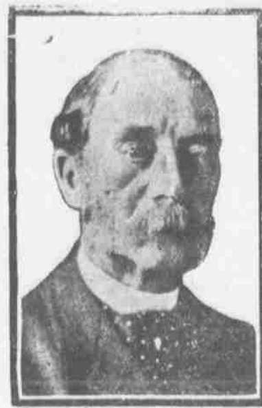
KING CHRISTIAN OF DENMARK