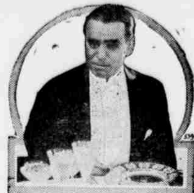
DOUGLAS FAIRBANKS in "Mr. Fix-It" An AIRCRAFT Picture

THE IDEA OF THIS STORY WAS SO GOOD THAT DOUG TEMPORARILY FORSOOK SPURS AND CHAPS FOR SPATS AND A MONOCLE TO PLAY IT FOR YOU. MACK SENNETT COMEDY.