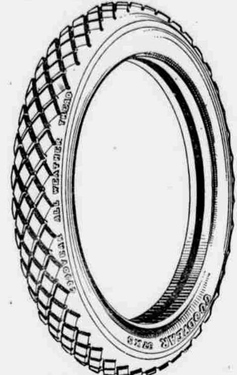
NAWILIWILI GARAGE, Agents for Kauai.