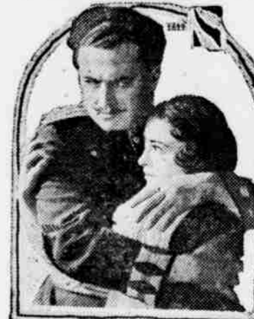
PAULINE FREDERICK in "Resurrection" A Paramount Picture

"Mr. Fix-It" program will be also shown at