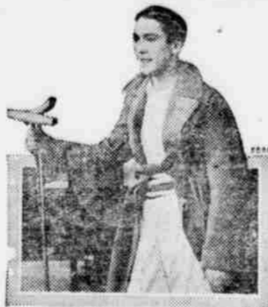
JACK PICKFORD in "Mile-A-Minute Kendall" A Paramount Picture