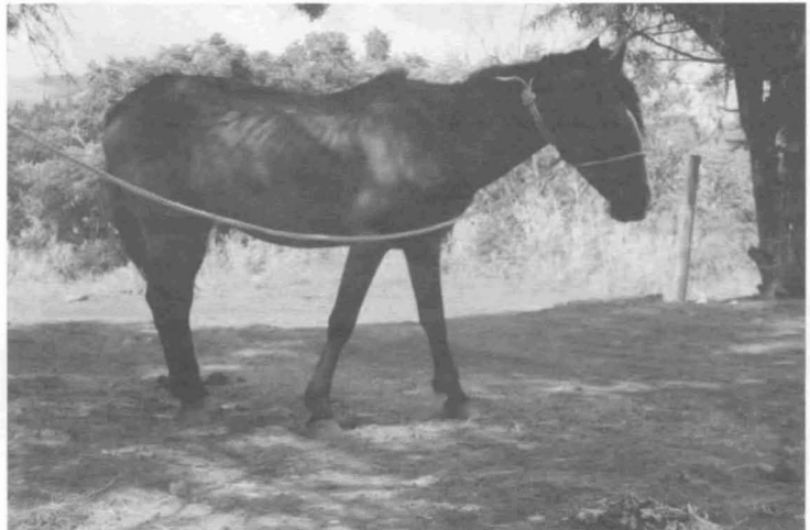
Pyrrolizidine alkaloid intoxicated horse near Rano Raraku. The front limb wide-based stance is a typical finding in animals with brain dysfunction secondary to liver failure (hepatic encephalopathy) and is thought to represent compensation for dizziness.

An important aspect of VRI's work on Rapa Nui has been providing free veterinary services and consultations to local ranchers regarding implementation of modern herd management practices. The most important aspects of modernization are confinement of animals within fenced pastures and reduction of herds of cattle and horses. Confinement has several advantages including prevention of toxic plant consumption and ability to provide supplemental feed and water. When sustenance is poor, a smaller herd will have increased productivity, as greater resources will be available to each individual animal. Confinement and herd reduction are, both, important in easing ongoing tensions among ranchers, park managers, and archeologists regarding public roaming of livestock.