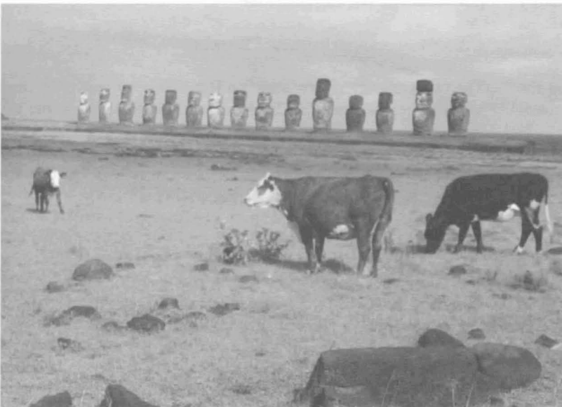
Cattle grazing the plaza of Ahu Tongariki. Livestock continue to graze important archaeological and historic regions despite the construction of retaining walls intended to exclude roaming animals.

In 2003, 4 of 23 (17%) surveyed ranchers indicated utilization of varying extents of confinement of cattle and regional elimination of Cho Cho with (subjectively) improved overall health. This is a marked improvement from 1999 when only 1 of 28 (4%) ranchers was limiting ranging of cattle. Obviously, the hope is that over the course of further efforts, more ranchers will learn and benefit from the examples of their peers and the advice of VRI veterinarians. The challenge in this matter is overcoming the well-established practice of free ranging of cattle. Additionally 18 of 23 (78%) ranchers indicated improved overall health of their animals after receiving de-worming medications and vitamin supplements from VRI. Though this is encouraging, the services currently provided by VRI are still inferior to the most basic management practices in the United States. Provision of such preventative medicine practices will expand over coming years with the goal of continually improving livestock welfare on Rapa Nui.