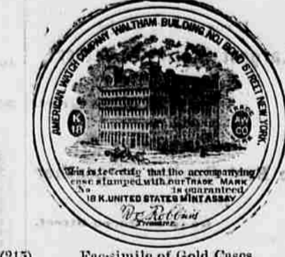
Fac-simile of Silver Cases. (215) Fac-simile of Gold Cases

JUST RECEIVED, A FINE ASSORTMENT OF Boots, Shoes, Slippers, Sandals, Ties, &c. ALSO— THE FINEST SELECTION OF GENTS' SCARFS, One in a box, all of which are Eminently Suitable for the Present Season. 277 A. W. RICHARDSON & CO.