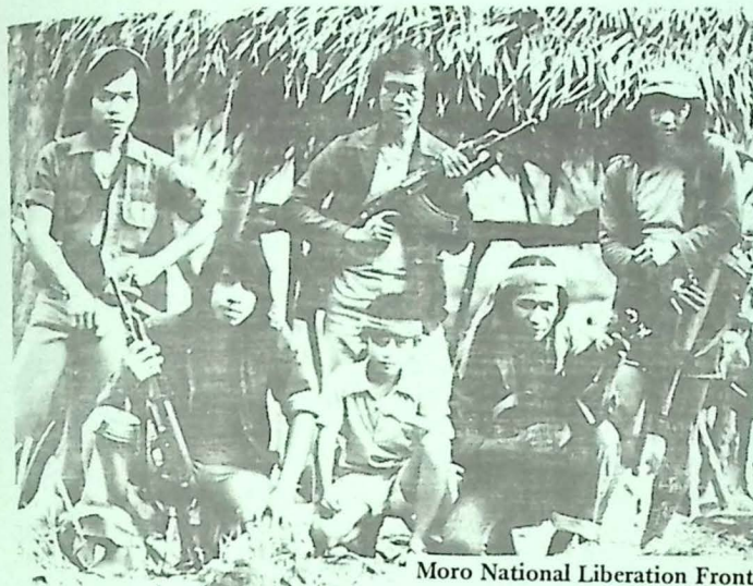
Moro National Liberation Front