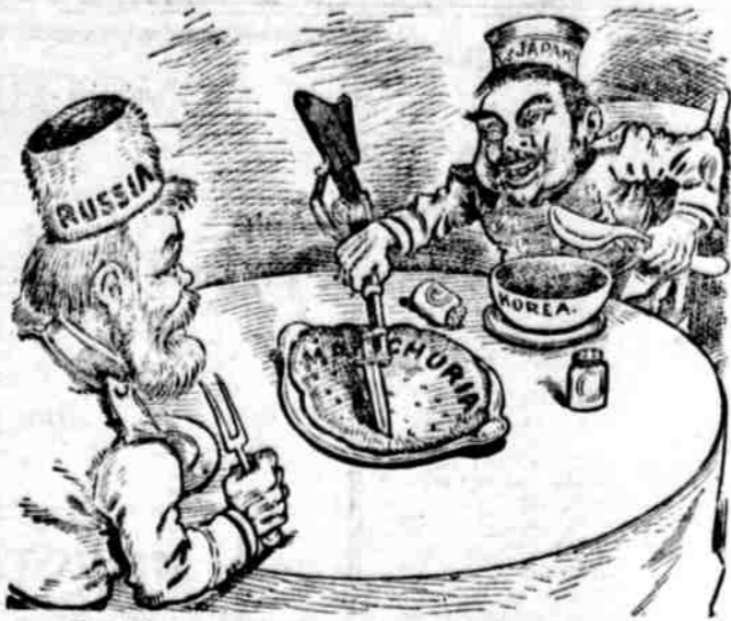
The little Jap has finished one dish and is ready for the next. —Minneapolis Journal.