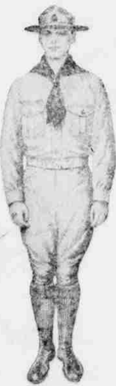
WHO HAS YOURS?

was a great time all right, and the only thing that it lacked was the small number of realtivies of the scouts. Wake up old folks, keep a better look out on what your boys are doing. Take a little time to interest yourself in your sons and their hobbies. It pays.