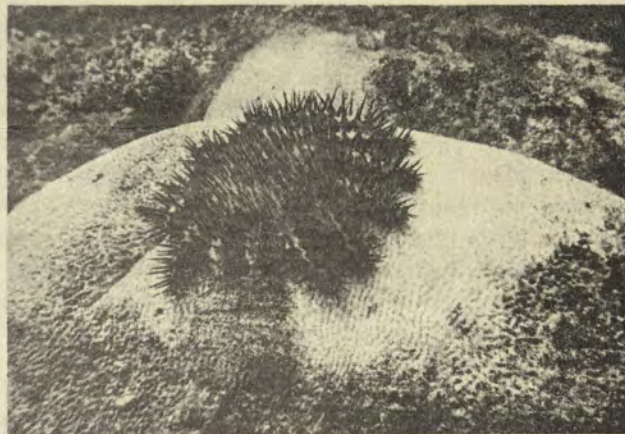
FEASTING ON A CORAL HEAD is the menacing Crown of Thorns starfish. The light areas were killed by the one spiny star in the previous 24 hours.