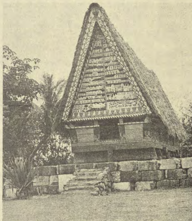
THE BAI of Ngesechel Ar Cherchar stands proudly in its permanent location at the Koror Botanical Park in Palau. For more photographs of the dedication see page 12.

Emphasizing the growing role which Micronesians will be expected to accept in the operation of their government, Johnston said, "One of the keynotes of this new administration is to repeatedly increase the involvement of Micronesians in the Administrative branch of their government and to tackle, and, eventually solve the problems of a government operated on three different pay scales. Our eventual