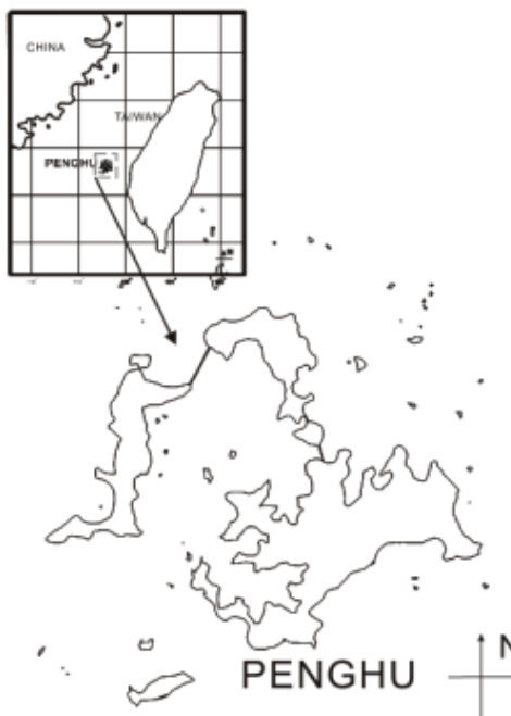
Fig. 1. The Penghu (Pescadores) Islands, Taiwan.

The economy of Penghu is heavily dependent on its marine resources. Marine cage aquaculture in inshore and offshore waters has emerged as one of the most important economic activities in Penghu (Taiwan Tourism Bureau, 1991). Development of cage culture began over twenty years ago. Cage culture systems have been used for research, growout of aquatic animals, and short-term holding of fishes (Beveridge, 1987). Most cages are located in inshore waters because of the strong northeastern winds (Chiang et