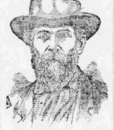
GENERAL GREENE IN 1863.