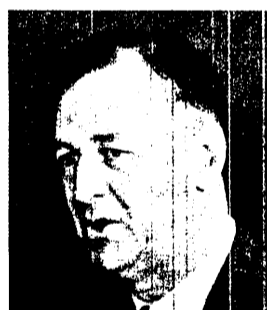
WITNESSES who criticized policy planning. Top, l. to r., Robert A. Lovett, ex-Secretary of Defense; Robert C. Sprague, chairman, Fed-