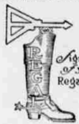
Regal Shoes Mean Solid Comfort Plus Style

In Regal Shoes you not only secure the most popular styles, but also the utmost foot-comfort—for Regal Shoes are made in Quarter sizes, and everyone can get exactly the size his (or her) foot requires.