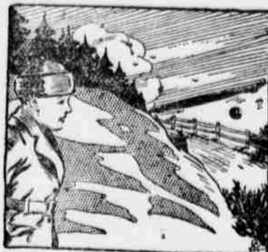
"I hope the birds build their nests near our bungalows," cried Jack

"So do I," added Janet. "It would be lovely to have them awaken us with their joyful morning songs and put us to sleep at night with their twilight lullabies."