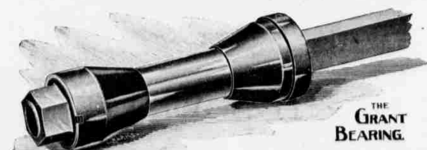
THE GRANT BEARING.

By having Rubber Tire and Roller Bearing Axles put on the Wheels of your Buggy, Hack or Dray by the Rubber Tire Wheel Company.