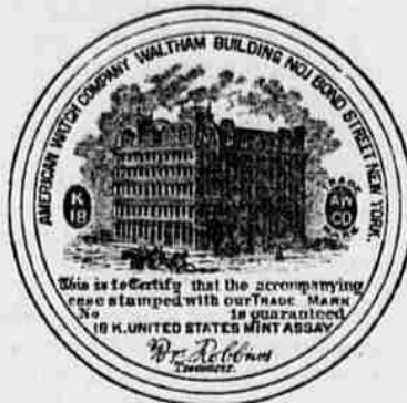
Fac-simile of Silver Cases. (215) Fac-simile of Gold Cases

FOR THE LADIES! S. MAGNIN Has Just Received from Paris Direct, 25 pieces Fine French Merino, 10 dozen Ladies' Cassimere Dolmans (beige-trimmed), 50 pieces Silk and Wool Poplins, 30 pieces Brocade Satin, Black Silks, Satins & Crapes, Col'd Woollen Dress Goods Silk Capes, and a fine lot of Ostrich Feathers, in all the newest and richest colors. Come and examine them, as they must be so without reserve. Also, to arrive per Steamship "Hankow," now due, in part as follows: Ladies' Black and Colored Silk Mitts, Black and Colored Satins and Surah Satins, Merinos, Ladies' and Children's Cloaks, Capes and Shawls fresh from the Best Parisian Houses, in all the Newest Styles and Patterns. Ladies' and Children's Lace and Lisle Hose, in all shades. For the Gentlemen—Men's, Youth's and Boy's Clothing lower than any other house in the trade. Also, a special line of C. & P. H. Terrell & Co's Men's and Boy's BOOTS and SHOES, which Will be sold at the Lowest Rates to clear consignment. You have only to see these goods to be convinced that you can't do better else- where. Visitors and friends from the other Islands are especially invited. 437 S. Magnin, Hotel St., Honolulu. 6m