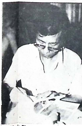
Jose Maria Sison