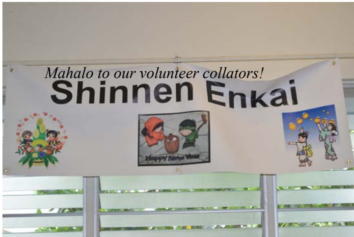
Shinnen Enkai 2015