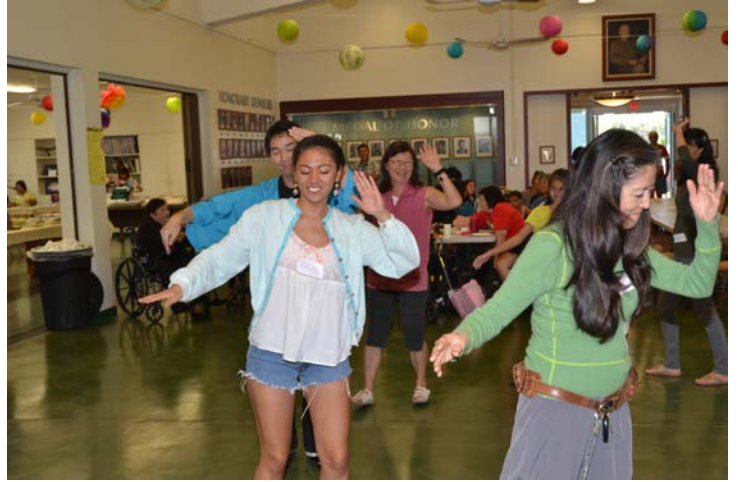
Bon dancing was fun!