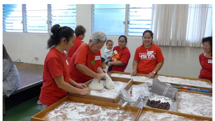
Making mochi cakes for ozoni