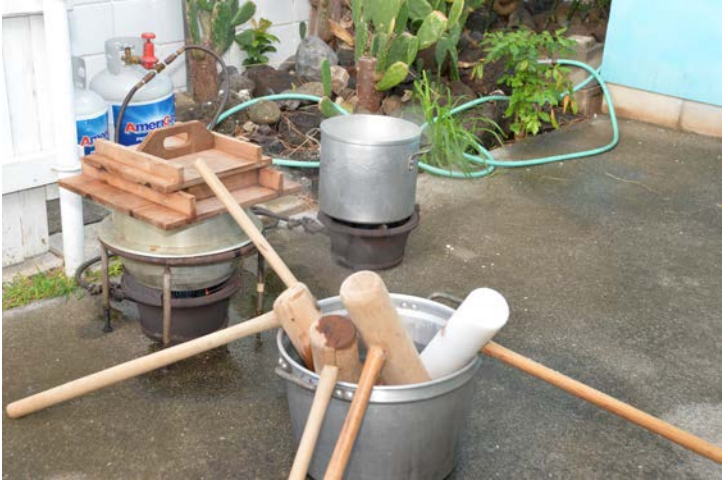
Getting ready for the mochi festivities