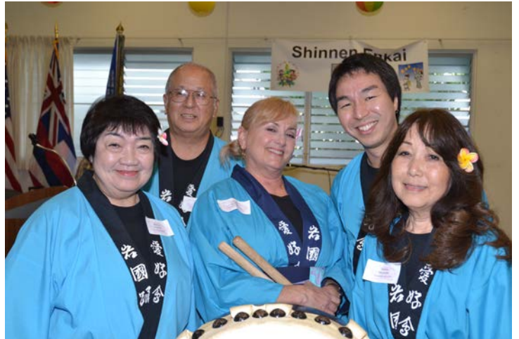
Mahalo Iwakuni Dance Group