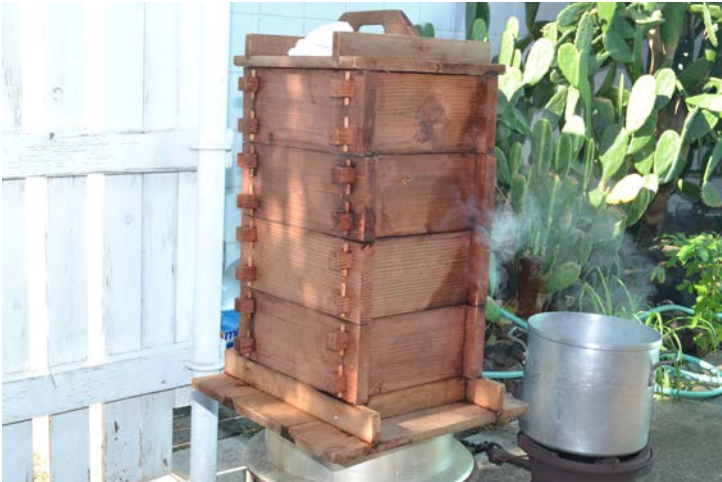
Steaming the mochi rice