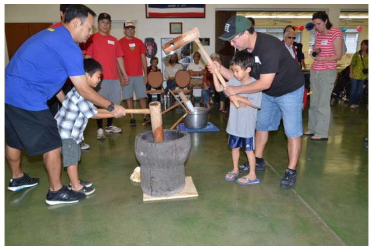
Passing on the tradition to the young ones