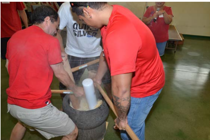
The smooth rhythm of mashing the rice