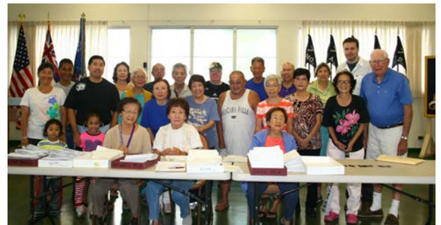
Mahalo to our volunteer collators!