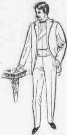
Copyright 1897 by The Stein Bloch Co.

What a man wears is a very reliable index of his character.