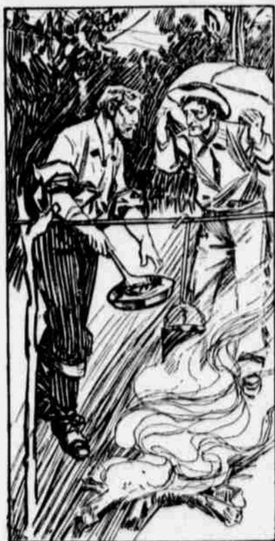
"How do?" greeted the newcomer.

That night he slept on the ground. Next day he made a better shelter than