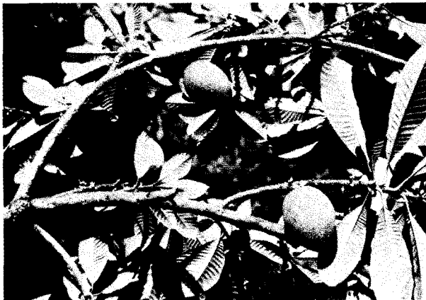
FIGURE 2.—Branch and fruit of the mamey sapote. Observe the formation of annual branches and the location of the fruit on the branches.

The fruit is ellipsoidal or ovoidal, with a prominent permanent calyx at the base, and a remnant of the pistil at the apex (fig. 4). It measures from 10 to 25 cm in length by 8 to 12 cm in width and many reach a weight of 3 kg. The thin but strong cortex is roughened and colored a rusty brown. The pulp is salmon colored, thick, aromatic and sweet, soft when ripe, almost free from fiber, and can be eaten with a spoon. Normally the fruit contains only a single seed, ellipsoidal or spindle shaped, 5 to 6 cm in length, with a hard testa.