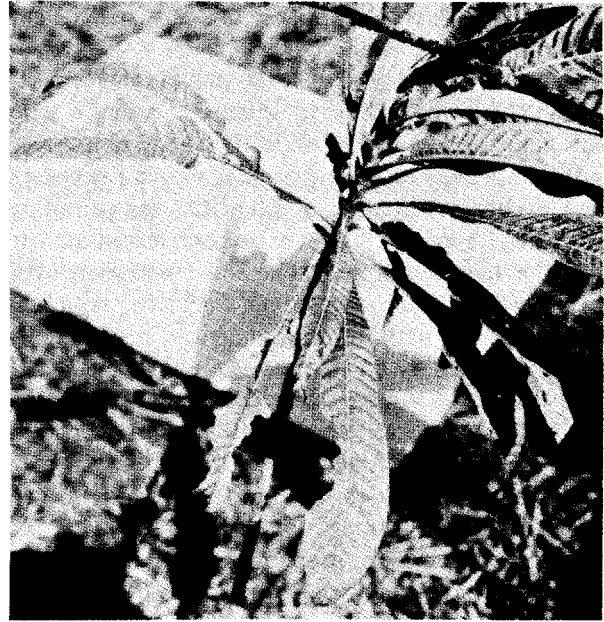
FIGURE 10.—Damage to the leaves of a young mamey sapote caused by the sugarcane root borer, Diaprepes abbreviatus L.

In all crops, the best conditions for growth, such as good preparation of the soil, careful planting, adequate fertilization, and good cultivation, are of great importance in the prevention of disease and insect attacks. Fortunately, few diseases and insects attack the mamey sapote, and the amount of damage caused is seldom significant. Although in some cases the control of light attacks may hardly be worth the effort, the