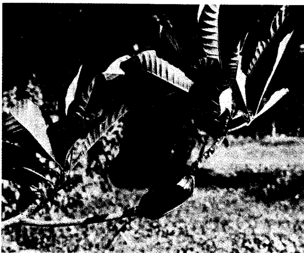
FIGURE 7.—Vegetative propagation by means of the air-layering technique.

Tests have been made at MITA to investigate the possible use of air layering as a propagating technique with the mamey sapote. Air layers were prepared at approximately 6-week intervals for 1 year, beginning in March 1967 and ending in December 1968. As a rooting agent, indolebutyric acid was used. The sphagnum moss was sterilized before application. Two months after tests were begun, the air layers were cut from the tree and examined for root production. In only 2 of the 20 air layers were roots produced. Although these particular air layers died after transplanting, there is promise for this technique, if more thorough investigation can be made of the problem.