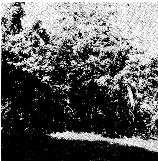
FIGURE 1.—Mamey sapote trees in production at the Mayagüez Institute of Tropical Agriculture. These trees were established from a good selection of seeds from Guatemala in 1939.

The name "mamey" originated from a confusion with the tree mamey, Mammea americana L. The exteriors of the fruits of the two species are somewhat similar, and the internal colors are about the same. In Puerto Rico, the word "mamey" also means orange. Almost everywhere the mamey sapote has been known, the name "zapote" is used, a word of Aztec origin (tzapotl), meaning fruit. It is known as zapote in Venezuela, Ecuador, Colombia, Central America, and Mexico. In Trinidad, Barbados, Dominica, and Jamaica, it is known as mamee sapota, marmalade plum, or marmalade fruit. In Guadeloupe and Martinique, it is called sapote or grosse sapote. In Cuba, the names "mamey colorado" and "mamey sapote" are used. In the Philippines and the Malay Peninsular, it is known as chico zapote or chico mamey. In Florida and California, the name "marmalade plum" is given. In Puerto Rico, the fruit is always called mamey zapote.