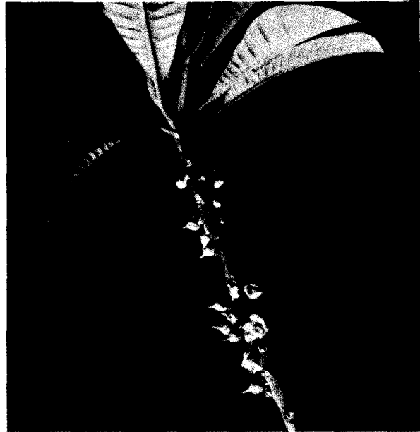
FIGURE 3.—The abundant, small, sessile flowers of the mamey sapote. Observe the groups of 8 to 10 leaves at the apex of the branches.

The mamey sapote is usually eaten fresh. The fruit is cut into two with a longitudinal cut, and the seed is easily removed. The smooth pulp can be eaten directly from the fruit. The cortex is hard and thus resists deformation during eating.