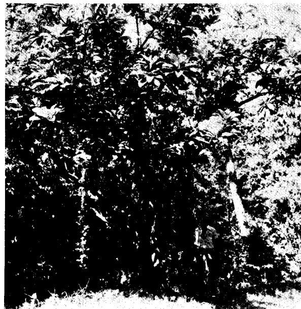
FIGURE 8.—Mamey sapote trees planted in a clay soil of moderate permeability, moderate fertility, and high acidity.

In Puerto Rico, several well-developed and productive trees are found in Barrio Anones, Las Mariás, where the soils are deep, acidic, with moderate permeability but good drainage. Fruits here are especially large and of good quality. The climate in this area is humid, and the rainfall is similar to that at MITA.