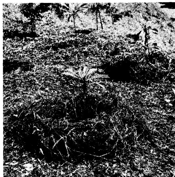
FIGURE 9.—Mulch prepared from weeds and grass to control weeds and reduce water loss.

When no other crops are sown, a green manure crop may be desirable. Such a crop has the advantage of rapid growth, reducing to a great extent weeding and cleanup. Normally, green manure crops are legumes because of the action