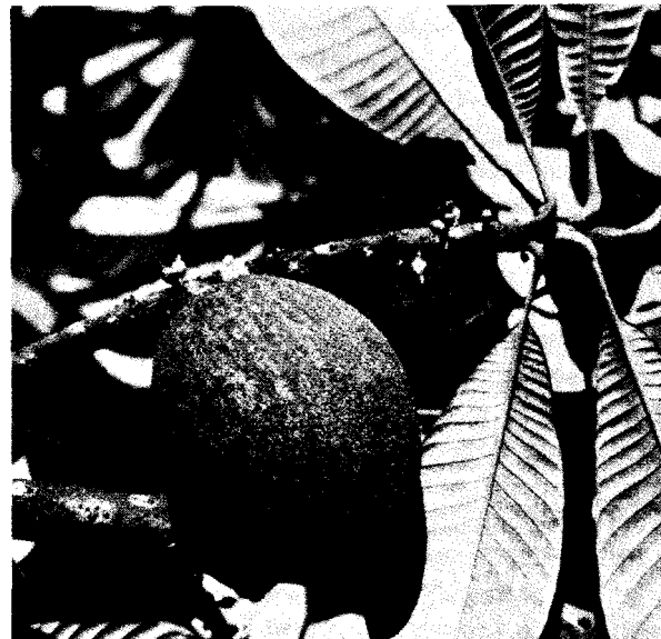
FIGURE 4.—The fruit of the mamey sapote with its thin rough cortex colored brown. The pulp is a reddish-brown.