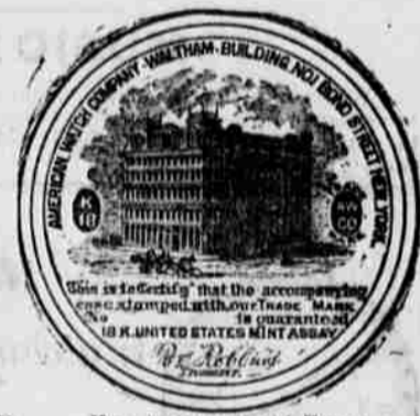
Fac-simile of silver Cases. (215) Fac-simile of Gold Cases