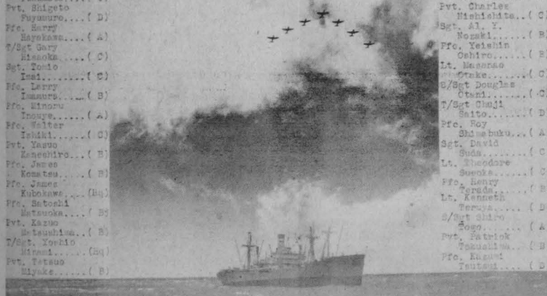
USAT Dalton Victory In Honolulu Harbor Sept 1, 1948.