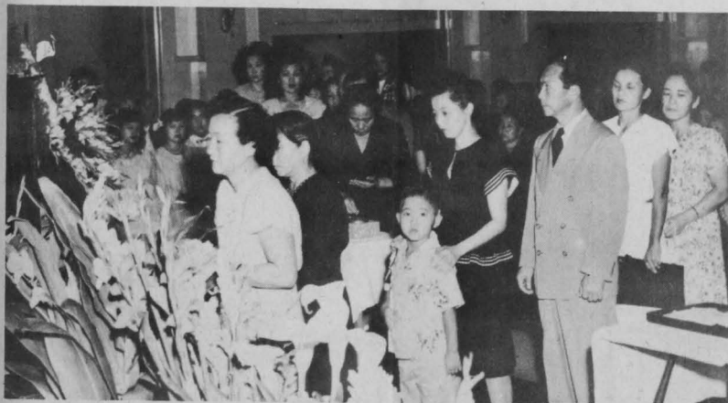
Next Of Kin At Oahu Chapter Memorial Service

An overflowing assemblage paid tribute to the 345 deceased of the 100th Infantry Battalion at the third annual Oahu Chapter memorial services held at the Hongwanji Mission on Wednesday, September 29, 7:30 P.M.