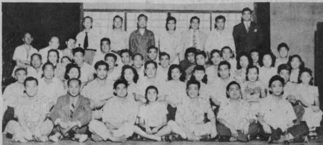
Omoide Cast And Crew