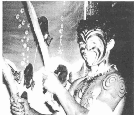
A Rapanui islander in the festival parade displays body paint that mimics early Polynesian tattoo designs.

No canoe races were held this year as only one canoe remains on the island; the other was swamped on the south coast and subsequently dashed to pieces on the rocks. The