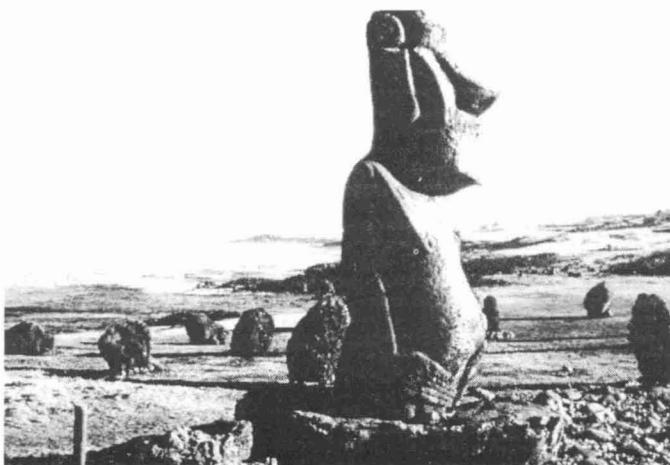
A new moai has been added to the waterfront. Carved and raised for Tapati, this latest addition sits on a rise, just above the “free-form” sculptures created for the festival. View is looking north towards Tahai.

Haka Pei (the “banana slide”) was again a spectacular event, one contestant being carried from the field on a stretcher. Other outdoor activities included the triathlon at Rano Raraku, and two nighttime outdoor performances— one