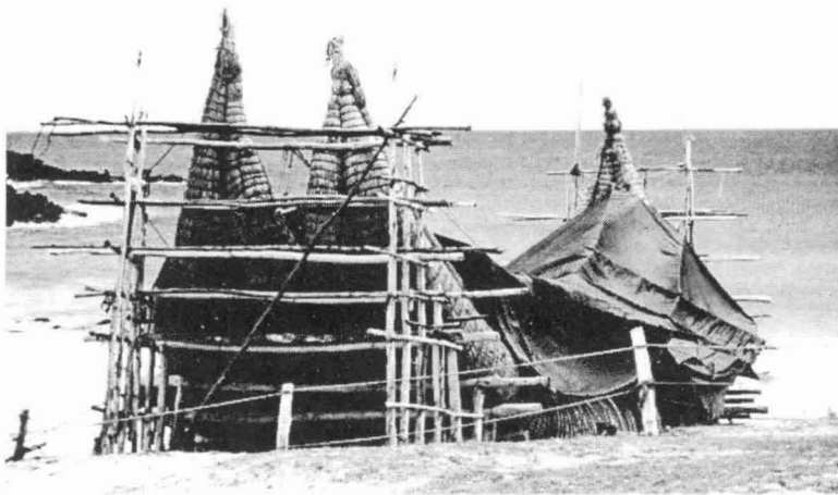
The reed boat being constructed by Kitin Muñoz crouches scorpion-like at Anakena beach.

having a phone, fax, minibar, air conditioner, safe, and ceiling fan. Tennis courts are to be built as well as two pools. The old wings will be torn down. Landscaping plans include paths for electric carts. The Hangaroa has been purchased by a chain of hotels from the continent and word has it that when the upgrades are completed, the new Hangaroa will be in the 4 star category. No doubt with four-star prices.