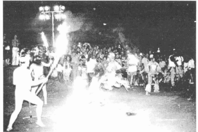
The Tapati festival parade featured decorated floats, torches, music, singing, body painting, pretty girls, and some nudity. A good time was had by all.

The final event was held at Hanga Vare Vare where a newly carved moai was erected by traditional means (levers and rocks). More conservative members of the village deplore the putting up of modern moai , feeling that tourists will