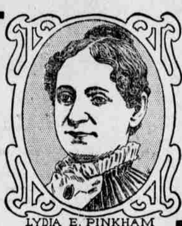
LYDIA E. PINKHAM

a more potent remedy in the roots and herbs of the field than was ever produced from drugs. In the good old-fashioned days of our grandmothers few drugs were used in medicines and Lydia E. Pink- ham, of Lynn, Mass., in her study of roots and herbs and their power over disease discovered and gave to the women of the world a remedy for their peculiar ills more potent and efficacious than any combination of drugs.