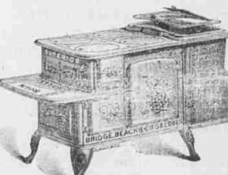
TELEPHONE No. 211.