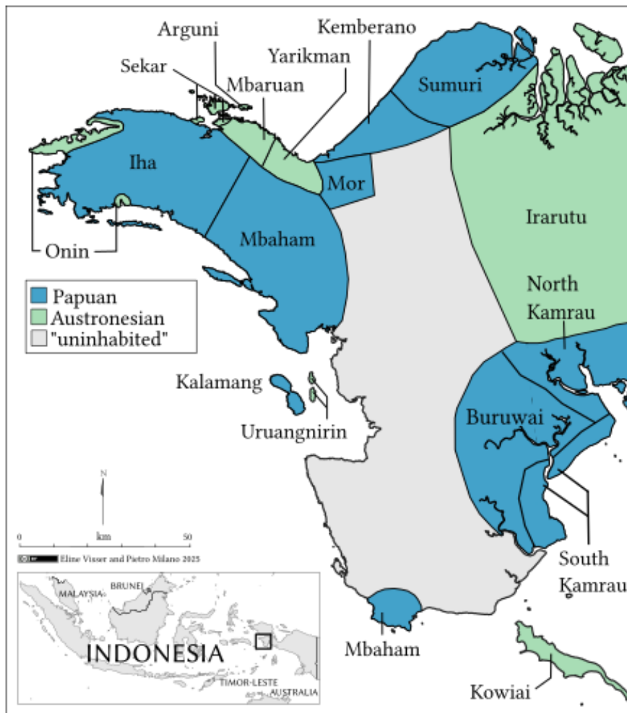
Figure 2: Languages spoken on and around Karas.

Besides Papuan Malay, there is a high command of Geser-Gorom amongst the people in Kiaba, the village where most of the fieldwork was carried out. Another language spoken by many is Kalamang, as many inhabitants of Kiaba have family in Mas, a Kalamang-speaking village. None of the languages besides Papuan Malay are transmitted to children. The language of communication between spouses in mixed marriages is Papuan Malay or Uruangnirin.